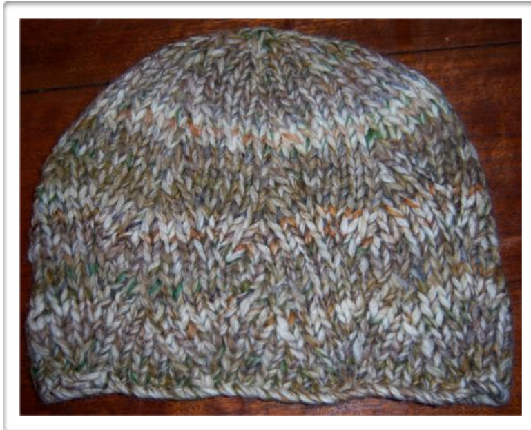
Flaming Man Hat