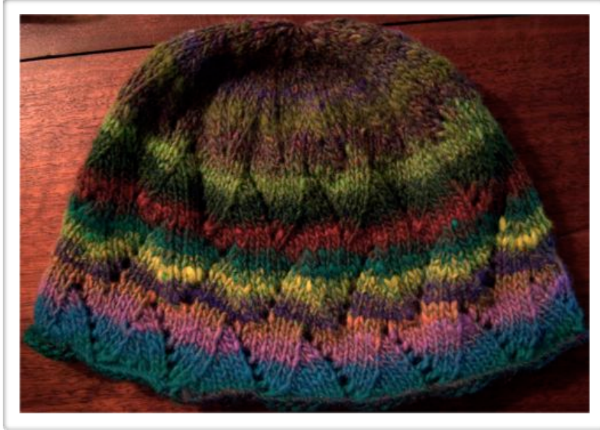
Flaming ZigglyZag Hat